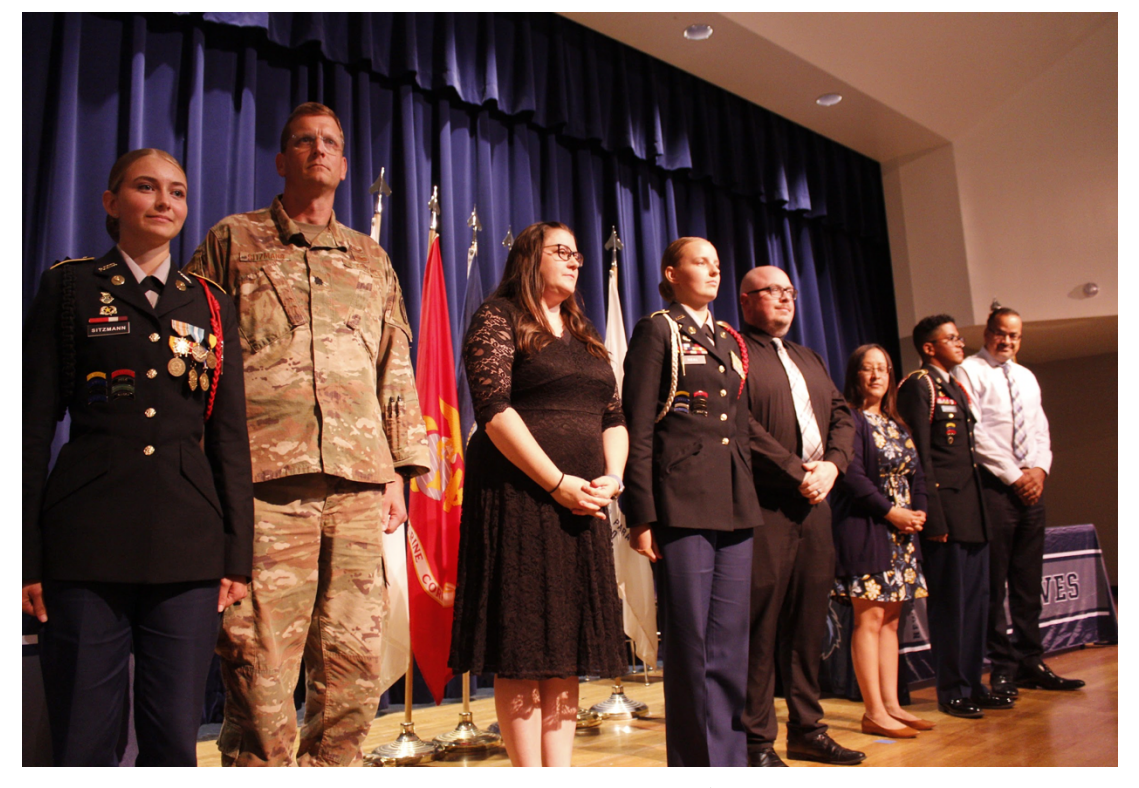
Key to Success... Teamwork