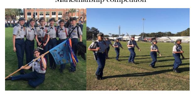
The Drill Team Female Regulation Armed Squad placed 1st at the UT competition (photo on the left). The Drill Team Male/Mixed Armed Squad placed 1st at the Zephyrhills competition (photo on the right)