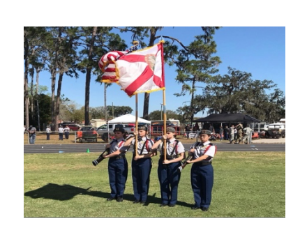
The Female Color Guard placed 1st in the Zephyrhills Drill Competition.