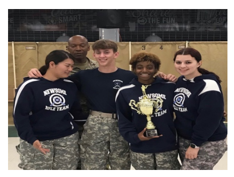
The Rifle team takes 1st at the Sickles Service Marksmanship competition