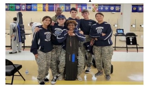
The Rifle team takes 10th place at the Anniston Rifle meet.